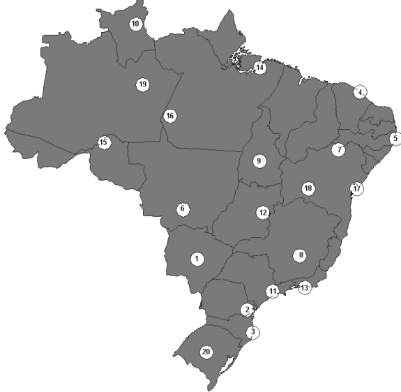
Fig.3: Location map of the measurement sites used to generate TMY series.

presents a short description of all available information to be use in GIS components of the SWERA project. The database available for implementation of GIS tools is being made in cooperation with several national agencies such as ONS, CEPEL, IBAMA, FUNAI, ANP, ANEEL, ELETROBRÁS, LABSOLAR and others.