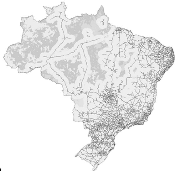
(A) (B) Fig. 4: GIS toolkit allow to make overlap energy resource maps and infra-structure information: (A) Query output showing areas with wind power density larger than 200W/m 2 and distant more than 100km far from electricity transmission lines (blue lines are the transmission lines); (B) Query output showing the Brazilian regions with solar irradiation larger than 5.5kWh/m 2 /day and distant more than 100km far from roads (green lines are the major Brazilian roads).